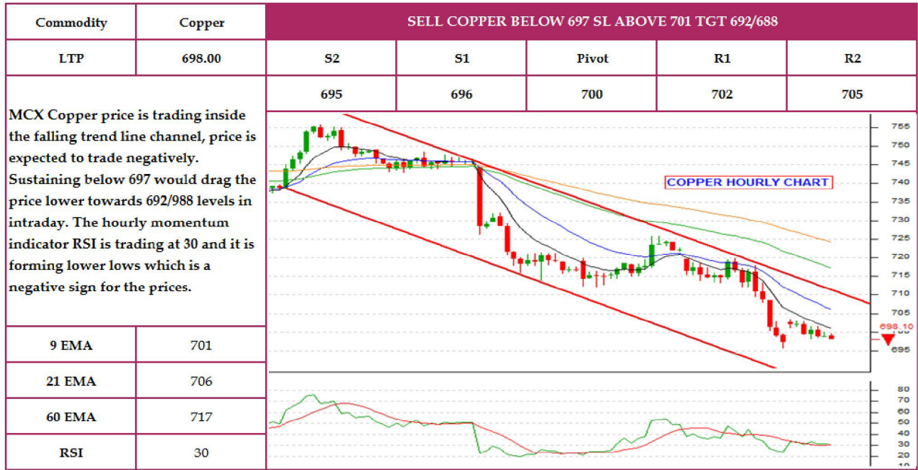
Chart of the days